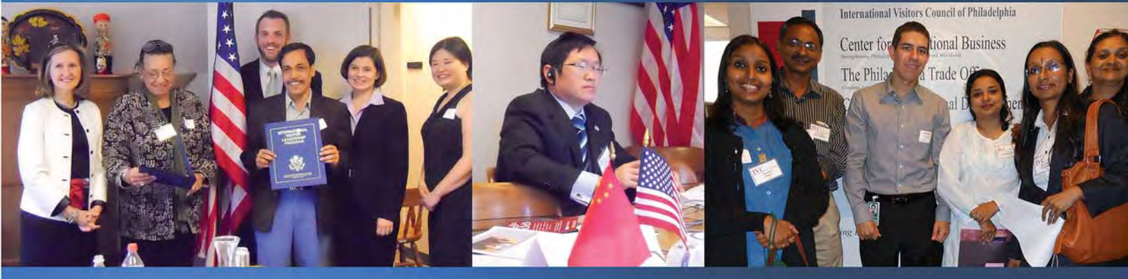
IVLP-this prestigious program is by invitation only. No one can apply

Citizen diplomacy is the right - if not the obligation - of the individual citizen to shape foreign relations