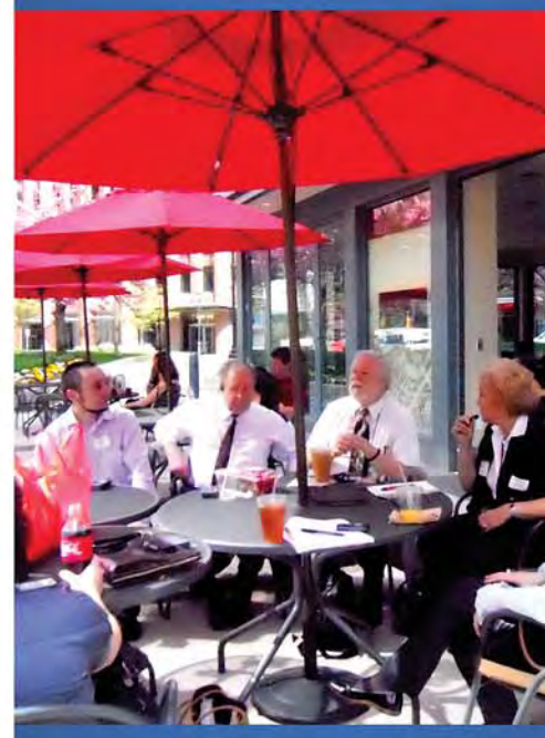
Time between meetings provided opportunities to enjoy Philadelphia's outdoor cafés.

The Community Connections Program brought participants to learn and explore cultural and interfaith issues through meetings with prominent area religious leaders.