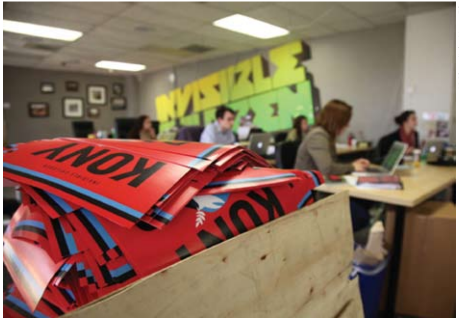
This photo shows a box of KONY posters at the Invisible Children Movement offices in San Diego on March 8, 2012. What can our students learn from exploring the KONY 2012 campaign?